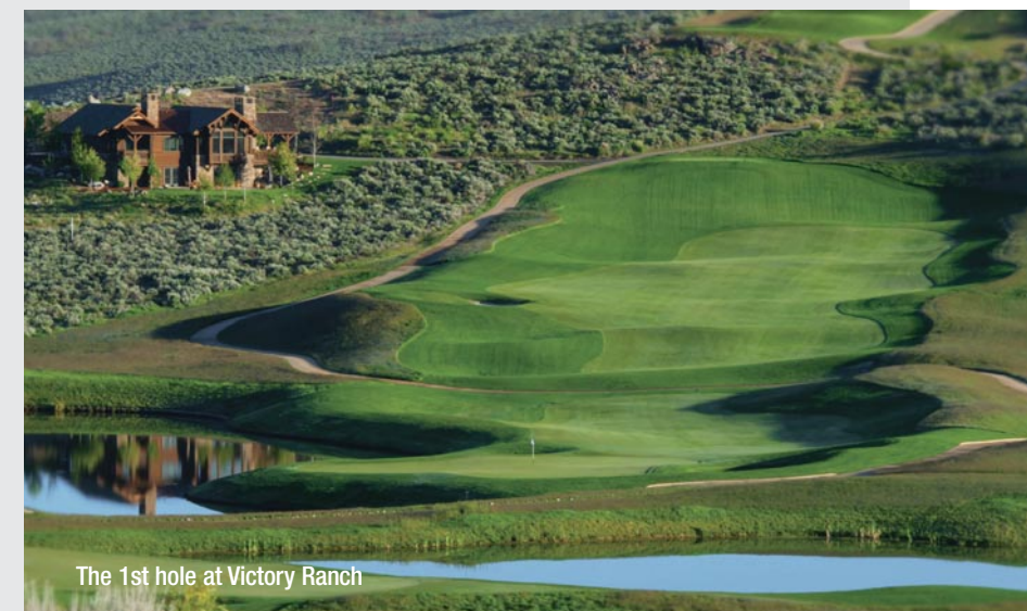
The 1st hole at Victory Ranch

I consider its course to be one of the more spectacular in the West. Its rugged topography created an opportunity for me to design a golf course that is dramatic in every respect. It fits beautifully with the flow of the land and it is not surprising that Golf Digest ranks it No. 2 in the state. Several holes are set high on a ridge. Whether you look up or down, the scenery is stunning. From the picturesque views of Deer Valley to the calming waters of the Jordanelle Reservoir in the valley below, you know you are in a special place." – REES JONES